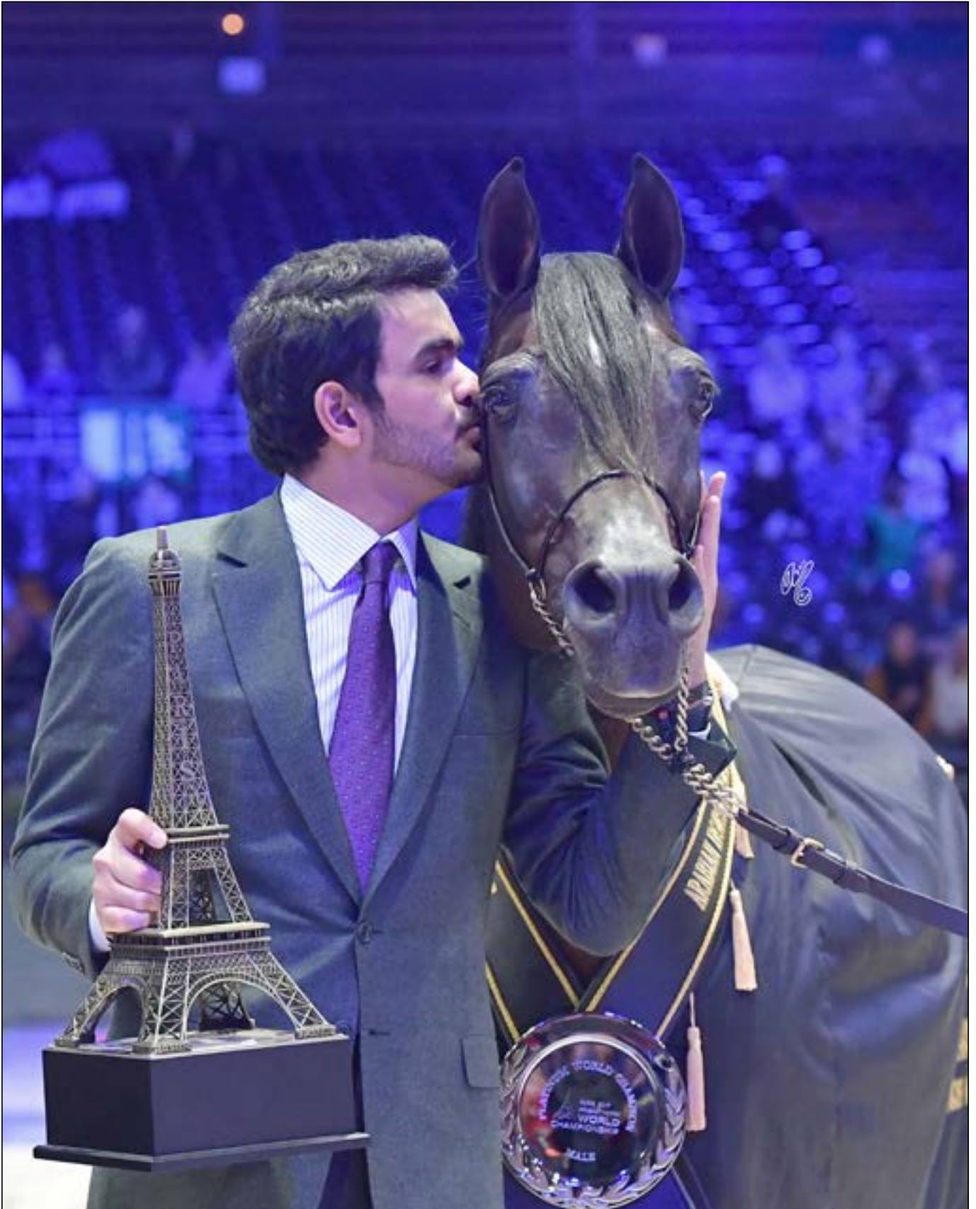
Platinum Medal Senior Stallion Arabian Horse World Championship 2017